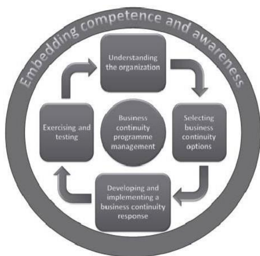
Figure1: Business continuity programme elements

Figure 1 below demonstrates that steps 1 - 4 are cyclical and these should be repeated at least annually to ensure compliance, currency and quality. Thus, business continuity plans and associated elements developed as a result of this policy will be living documents that will change and grow as incidents happen, exercises are held and risks are reassessed